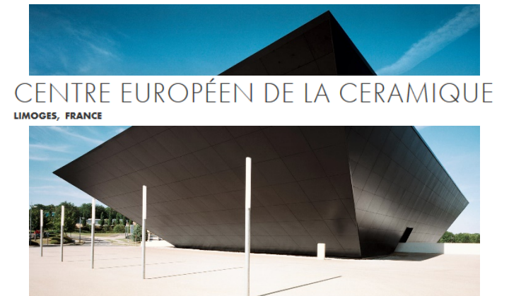
CENTRE EUROPÉEN DE LA CERAMIQUE LIMOGES, FRANCE